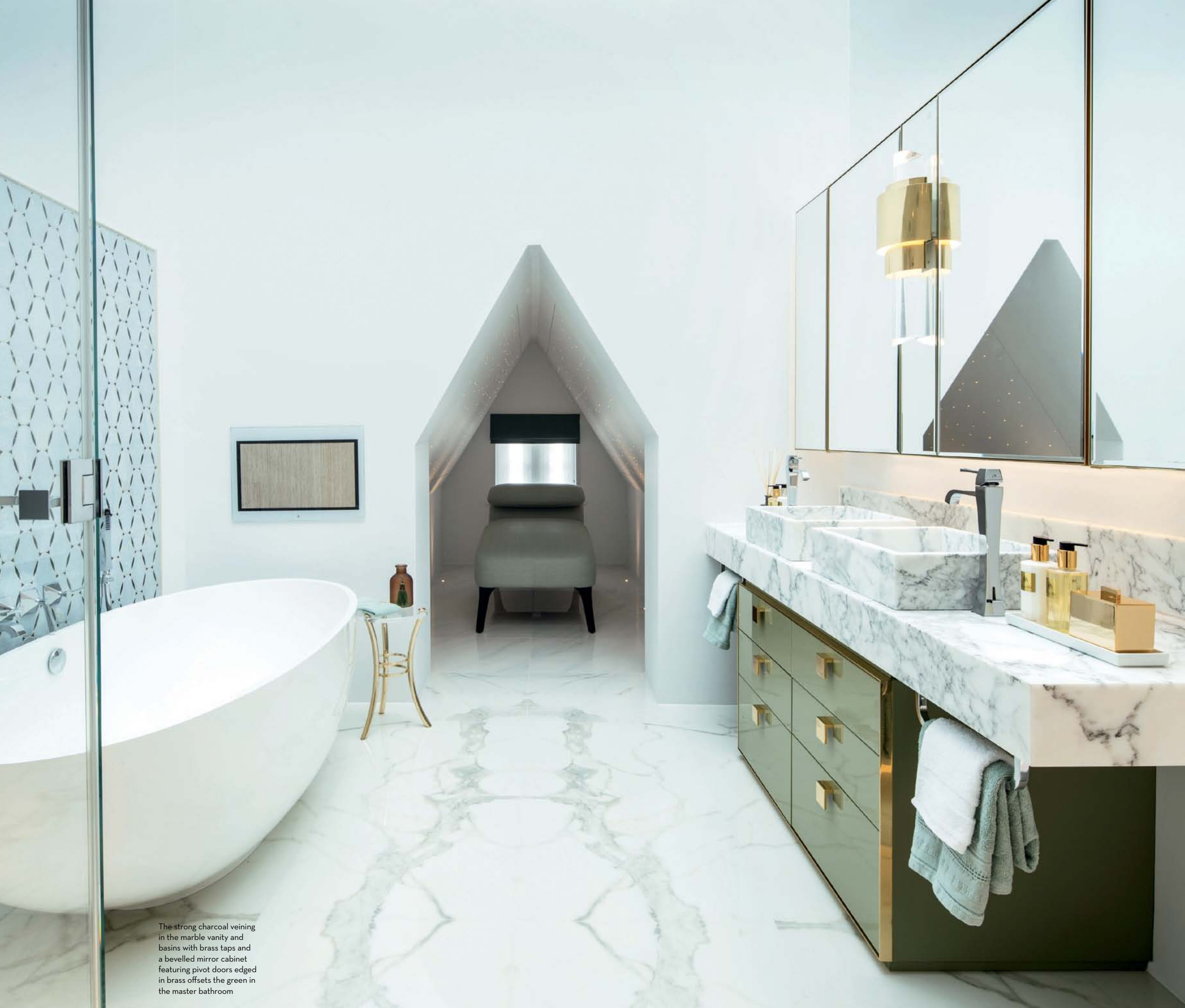
The strong charcoal veining in the marble vanity and basins with brass taps and a bevelled mirror cabinet featuring pivot doors edged in brass offsets the green in the master bathroom