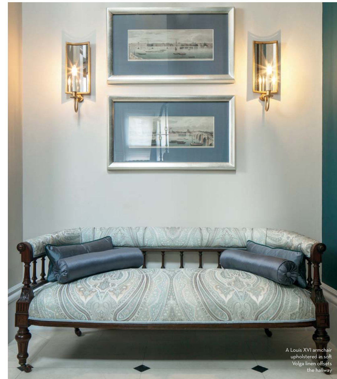
A Louis XVI armchair upholstered in soft Volga linen offsets the hallway

The apartment features a sweeping staircase that allows for a graceful division between the home's entertainment and sleeping areas, all set against grand high ceilings, gothic cornicing and limestone fireplaces